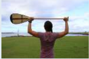
Paddle Held Horizontally- “I see you, and will hold position.”