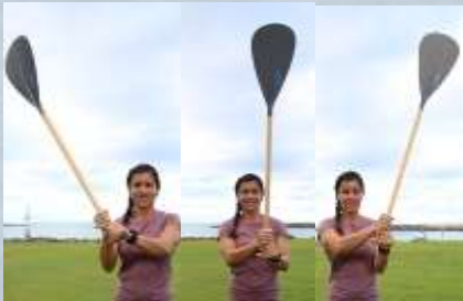
Paddle held vertically, frantic waving from side to side OR Arms vertically moving up and down- “I am disabled and cannot move.”