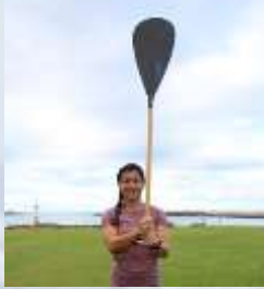
Paddle Held Vertically- “I see you and will stay out of your way.”